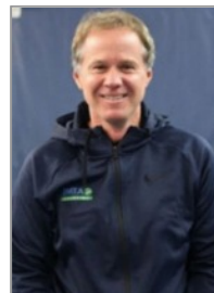
Patrick McEnroe JMTA Director

We know that from whom you learn has as much impact as what you learn, and your professional development at SPORTIME will be supported by a team of experts and mentors with experience across every area of coaching. From a coach's first day on court to support of our coaches who progress to coaching in international competition and on the ATP or WTA Tours, the SPORTIME team will give you the knowledge and skills to take your coaching to the next level.